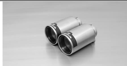
#98C: tail pipe Ø 98 mm Street Race, polished