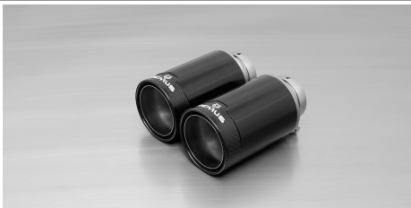
#98CB: tail pipe Ø 98 mm Street Race Black Chrome