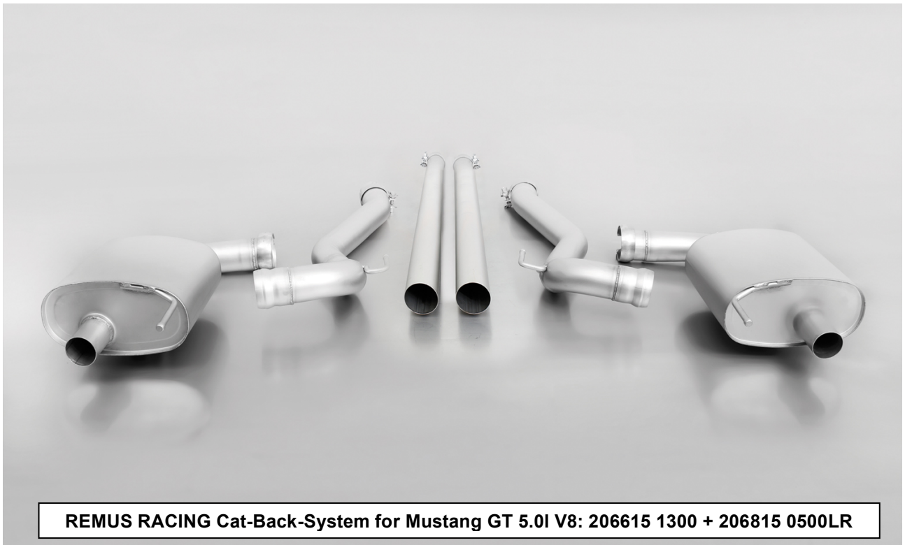
REMUS RACING Cat-Back-System for Mustang GT 5.0I V8: 206615 1300 + 206815 0500LR