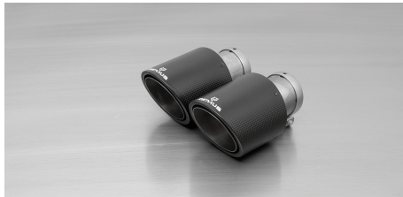
#70CS: Carbon tail pipes Ø 102 mm angled, Titanium internals