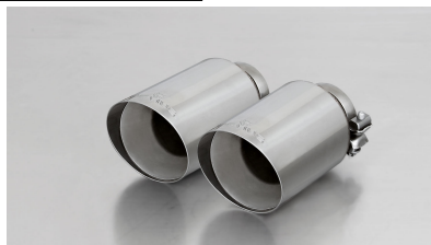
#70SG: tail pipe Ø 102 mm angled, straight cut, chromed