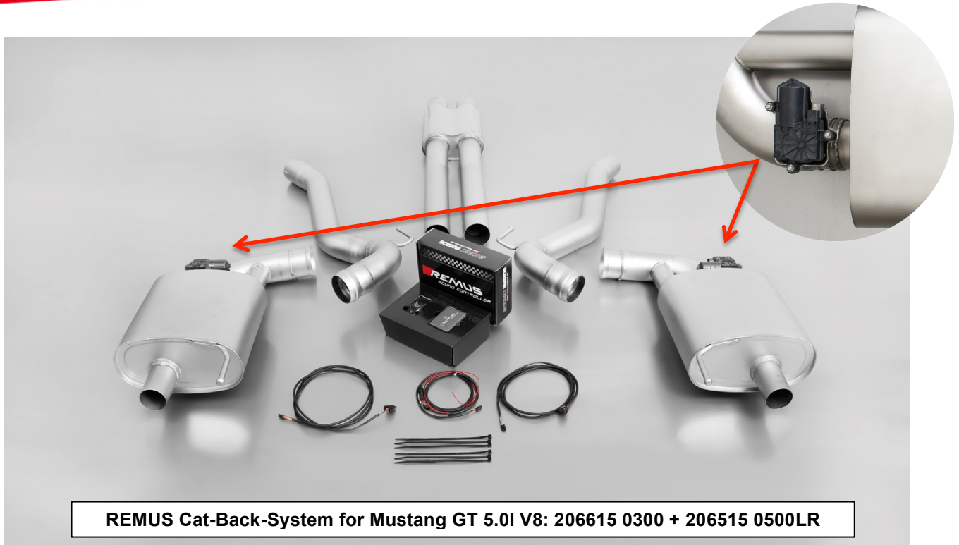
REMUS Cat-Back-System for Mustang GT 5.0I V8: 206615 0300 + 206515 0500LR