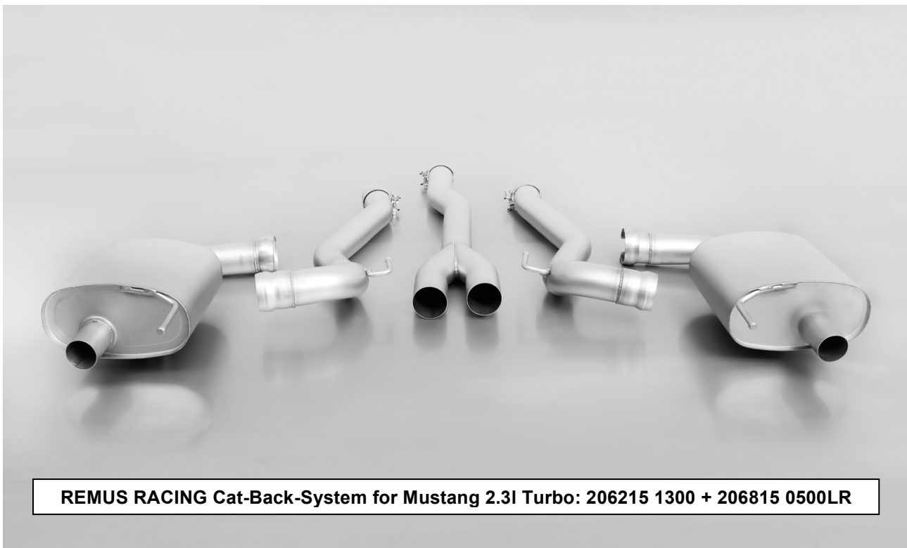
REMUS RACING Cat-Back-System for Mustang 2.3I Turbo: 206215 1300 + 206815 0500LR