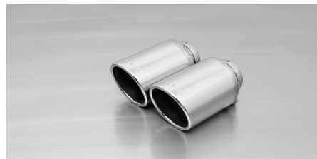
#70S: tail pipes Ø 102 mm angled, chromed