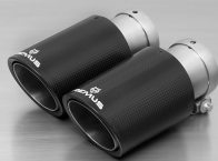
#83CTS: Carbon-tail pipes Ø 84 mm angled, Titanium internals