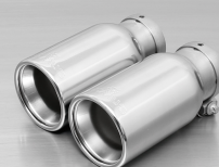
#05: tail pipes Ø 90 mm, chromed