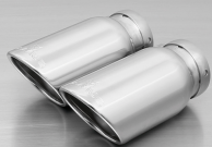
#55S: tail pipes Ø 84 mm angled, chromed