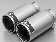
#83C: tail pipes Ø 84 mm Street Race, polished