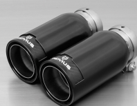
#83CB: tail pipes Ø 84 mm Street Race Black Chrome