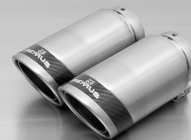
#83CS: tail pipes Ø 84 mm Carbon Race, polished