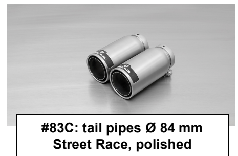
#83C: tail pipes Ø 84 mm Street Race, polished