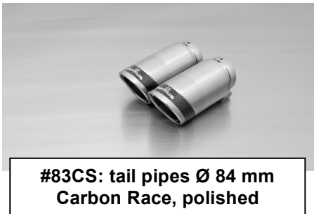
#83CS: tail pipes Ø 84 mm Carbon Race, polished