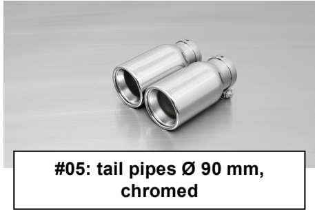
#05: tail pipes Ø 90 mm, chromed