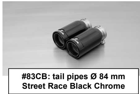
#83CB: tail pipes Ø 84 mm Street Race Black Chrome