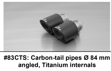
#83CTS: Carbon-tail pipes Ø 84 mm angled, Titanium internals