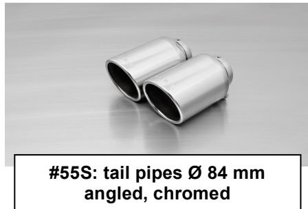
#55S: tail pipes Ø 84 mm angled, chromed