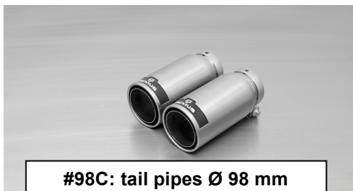
#98C: tail pipes Ø 98 mm Street Race, polished