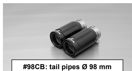
#98CB: tail pipes Ø 98 mm Street Race Black Chrome