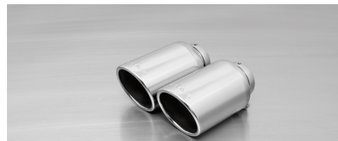
#70S: tail pipes Ø 102 mm angled/angled, chromed