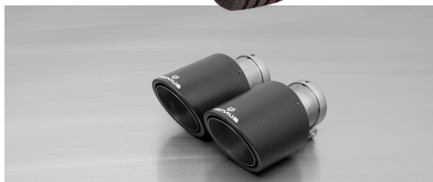
#70CSS: Carbon-tail pipes Ø 102 mm angled/angled, Titanium