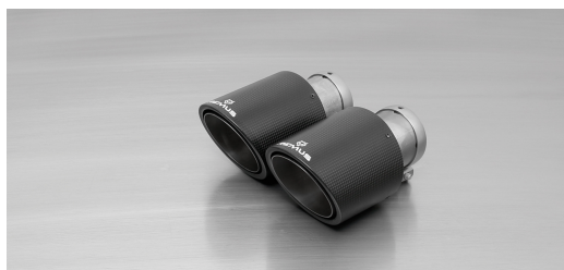
#70CS: Carbon tail pipes Ø 102 mm angled, Titanium internals