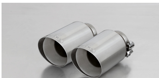
#70SG: tail pipes Ø 102 mm angled, Straight cut, chromed