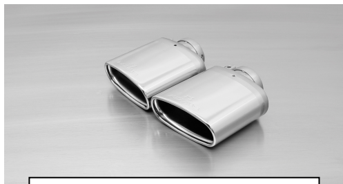
#14SS: tail pipe 142x72 mm angled/angled, chromed