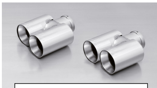
#04G: tail pipe Ø 76 mm, straight cut, chromed