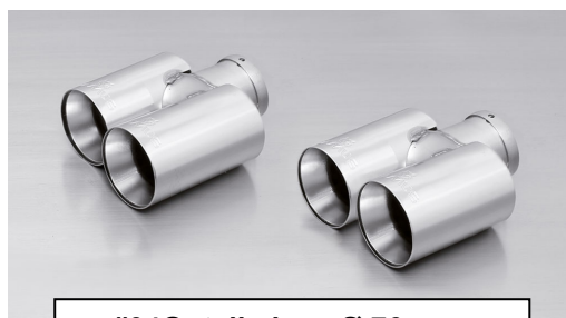
#04G: tail pipes Ø 76 mm, Straight cut, chromed