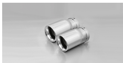
#03: tail pipes Ø 76 mm, rolled edge, chromed