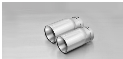
#03G: tail pipes Ø 76 mm, straight cut, chromed