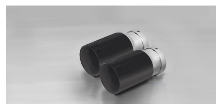
#03GB: tail pipes Ø 76 mm, straight cut, Black Chrome